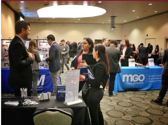
The Accounting Society hosts the annual Meet the Firms event at CSUDH every fall.