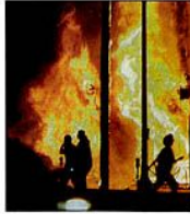
▲ Flames engulf a row of businesses at Vermont and Manhattan.