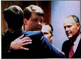
▲ Trial Governor displays troops of mayor's impact after verdict, holding jury apparently was not convinced that videotape told the whole story.