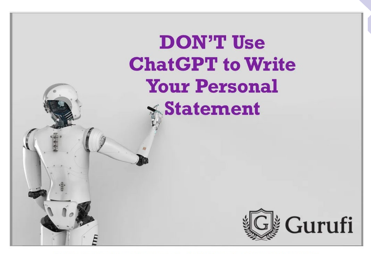
Al can be a powerful tool for many tasks, but NOT for writing Personal Statements!