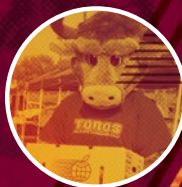
CULTURE OF CARE