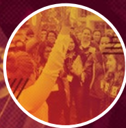
PILLAR OF THE COMMUNITY