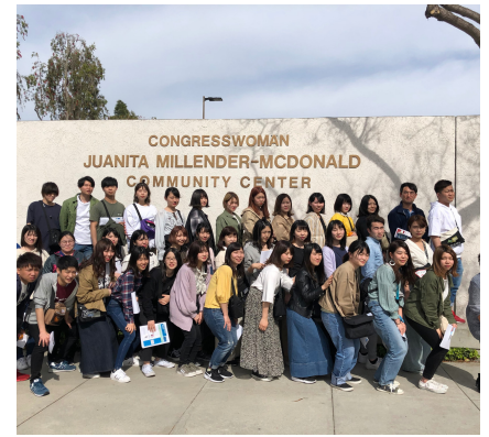
BY: Jina Song

I found the students to be extremely kind and generous. I had such a great time getting to know the students through different activities. The most enjoyable moment for me was painting a mural with the students and learning about what they like to do. I thought it was neat how although we spoke different languages we were still able to connect through meaningful occupations.