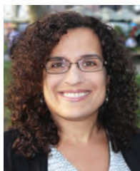
Laura Gambino Guttman Community College

Two decades after their introduction, ePortfolios have outgrown their early use as online repositories of student work. At the vanguard of the practice, they now drive personal growth, metacognition and reflection. Paradoxically, their powerful benefits for individual learners are also influencing institution-wide culture change, helping institutions move from instruction-centered to student-centered organization. Eynon and Gambino have written a pair of books examining the use of ePortfolios for deep learning, institutional reform and coherence, and full preparation for students' lives after college. Participants will develop plans for designing and adopting a campus-wide culture of portfolio thinking, as a means of scaling and embedding high-impact practices in the experience of students from all backgrounds.